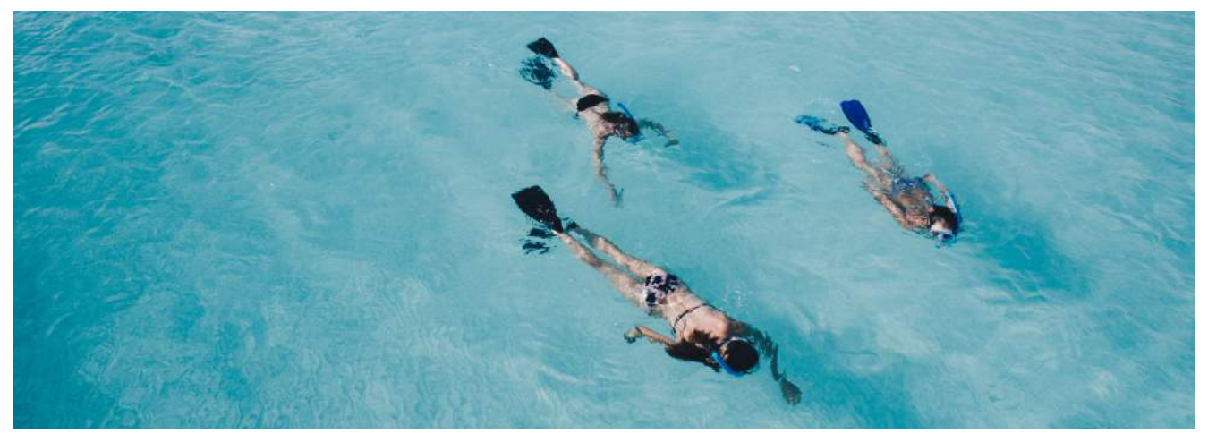
DAY 7: LABUAN BAJO

This morning, the boat will return to the port of Labuan Bajo. After a farewell breakfast onboard, your crew will assist you with disembarking and escort you to the airport to catch your flight home.